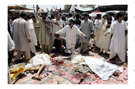
Pakistani Muslim devotees grieve after a suicide bomber blew himself up in the middle of a shrine in Islamabad, killing more than a dozen people in May.

Despite these successes, al-Qaida and Taliban operations in Pakistan continue to pose a threat to U.S. interests, and tribal support for operations against al-Qaida and the Taliban is mixed.