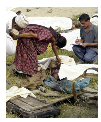
A Nepalese woman tries to identify a relative after a bomb ripped through a passenger bus in Kalyanpur in June. The incident was the worst attack targeting civilians since the beginning of the Maoist insurgency.

Nepal's primary focus remained the Maoist insurgency, active in Nepal since February 1996. In 2005 alone, Maoists were responsible for the deaths of at least 263 civilians and 330 government security forces, according to press accounts. The government reports that Nepalese security forces arrested thousands of suspected Maoist militants and killed more than 966 in 2005.