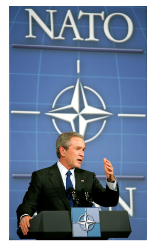
President George W. Bush during a news conference following a NATO Summit in February in Brussels.

Overall awareness of the terrorist threat to Belgium increased this past year, partly in reaction to the London bombings, but also in response to home-grown threats to Belgian security. The London bombings intensified Belgium's continuing effort to improve cooperation with foreign security agencies. Belgian police continue to work directly with such agencies both in neighboring and more distant countries. In addition to long-standing arrangements with police in Germany, France, and the other two Benelux nations, Belgium now has cooperation agreements with Spain, Italy, and the United Kingdom. Cooperation with the United States also continued to improve under the efforts of Belgian Interior Minister Dewael. Belgian authorities stressed the need for more information sharing in order to move legally against suspected terrorists.