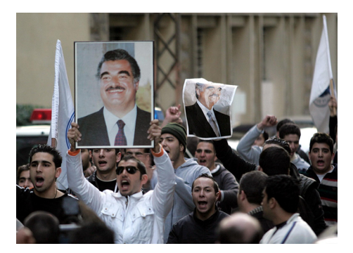
Following the February 14 assassination of former Lebanese Prime Minister Rafiq Hariri and 22 others, his supporters demonstrate in Beirut. Hariri was killed in a huge explosion in central Beirut.

In April, Syrian military forces and overt intelligence agents departed Lebanon after 29 years of occupation. Terrorist activities were still carried out in Lebanon, however. Israeli positions in the Blue Line village of Ghajjar in the Israeli-occupied Golan region were attacked on November 21, probably by Hizballah. Al-Qaida in Iraq claimed responsibility for a rocket attack on Israel from Lebanese territory on December 27, but some analysts suspected "rejectionist" Palestinian groups or Hizballah as the perpetrator and, thus far, a clear determination of