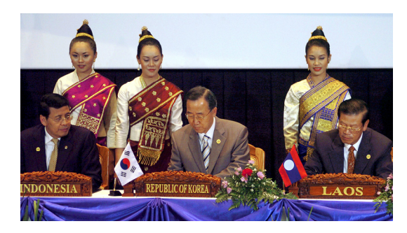
South Korean Foreign Minister Ban Ki-Moon (center) and his Lao counterpart Somsavat Lengsavad (right) sign a joint declaration to combat international terrorism during a meeting of the Association of Southeast Asian Nations (ASEAN) in Vientiane in July, while Indonesian Foreign Minister Hassan Wirajuda (left) serves as a witness.

levels see terrorism as an issue of only marginal relevance to Laos; they believe that Laos, as a small and neutral country, would not be targeted by international terrorists.