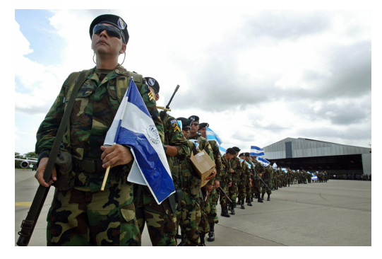
Salvadoran soldiers of the Cuscatlan Battalion board a military plane headed for Iraq in August. El Salvador is the only Latin American country with troops in Iraq.

El Salvador backed its outspoken support for the United States-led coalition in the global war on terror by sending a fifth troop rotation to Iraq in August.