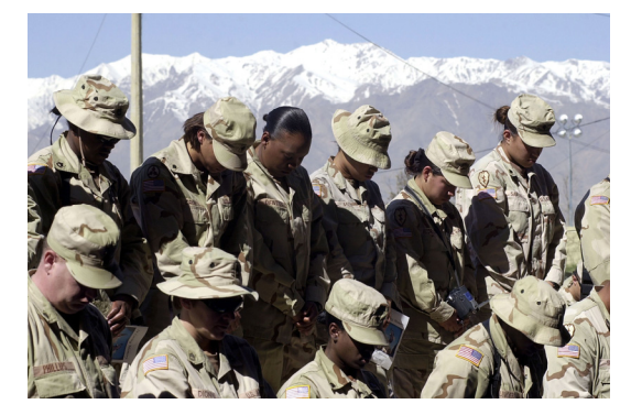
U.S. soldiers silently pay their respects to fallen comrades killed in a helicopter crash in Afghanistan.

Afghanistan continued its progress toward building a democratic government, holding National Assembly and provincial council elections in September. In spite of Taliban threats to disrupt the democratic process, only minor incidents occurred, and the election results were accepted as legitimate by the Afghan people. The National Assembly was inaugurated December 19, marking the final milestone of the Bonn Process.