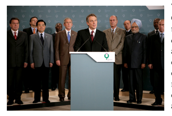
President George W. Bush and fellow G8 leaders stand behind British Prime Minister Tony Blair as he addresses the media on July 7, regarding the terrorist attacks in London earlier in the day.

The Group of Eight (G8) -- the United States, Canada, France, Germany, Italy, Japan, Russia, and the United Kingdom -- was instrumental in developing cutting-edge counterterrorism standards and practices. These included enhanced travel document security standards, as well as strengthened controls over exports and stockpile security to mitigate the threat to airports from illicit acquisition of shoulder-fired anti-aircraft missiles (man portable air defense systems, or MANPADS).