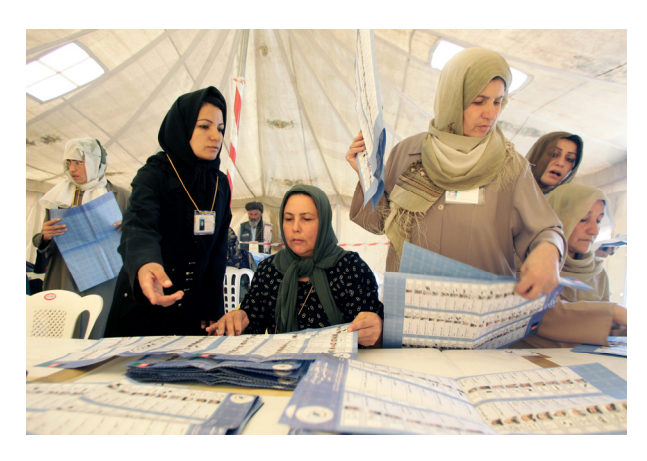
Afghan women count ballot papers in Herat following the country's September parliamentary elections, Afghanistan's first free elections in more than 30 years.

Hamid Karzai, President of the Islamic Republic of Afghanistan Afghanistan Development Forum April 4, 2005