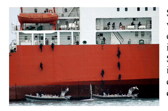
Singapore Armed Forces commandos board a vessel during a simulated exercise off the Singapore Straits in March 2005.

Singapore Phase Three, a program that evaluates vulnerabilities in maritime trade lanes that could allow entry of weapons of mass destruction, contraband, or illegal immigrants into U.S. ports. In September, Singapore, Indonesia, and Malaysia launched an "Eyes in the Sky" initiative, whereby the three nations will conduct combined maritime air patrols over the Straits of Malacca and Singapore.