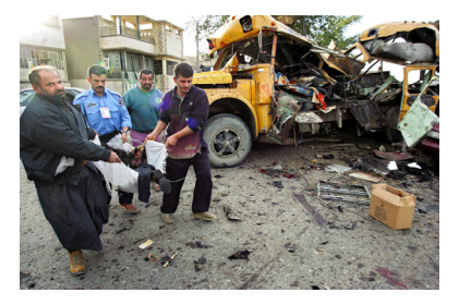
Iraqis carry the body of a young girl who was killed in a combined mortar attack and suicide bombing in an apparent strike against Iraqi Muslim Shiites returning from commemorating Ashura, a holy day of the Shite Muslim year, in February.

Iraq remains a key front in the global war on terror; US, Coalition, and Iraqi forces are engaging international terrorists as part of the security mission mandated by UNSCR 1546 and 1637 in support of the democratically-elected Iraqi government.