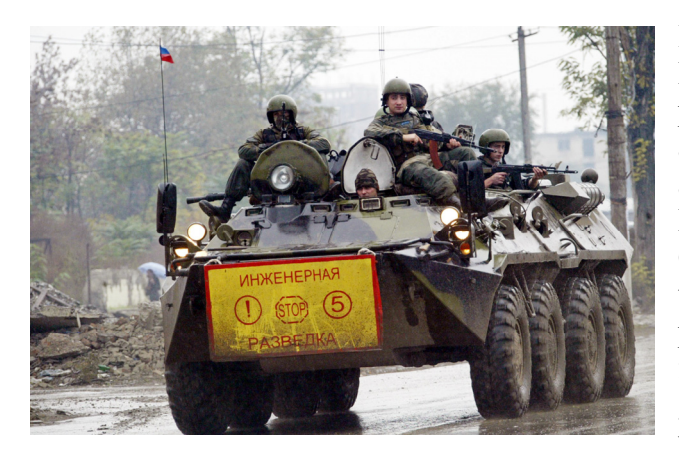
A Russian army armored personnel carrier patrols a street of Grozny in October after a roadside blast targeted their convoy in the center of the Chechen capital.

Chechen separatist leadership structure.