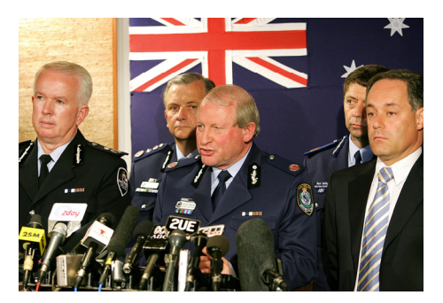
Australian police officials speak at a press conference in Sydney in November after foiling what they described as a "large-scale terrorist attack" in Sydney and Melbourne. Officers arrested more than a dozen suspected terrorists.

Australia launched substantial initiatives and worked with its regional neighbors to assist in building their resolve and capacity to confront terrorism. In November, Australian police arrested 18 suspected terrorists in Sydney and Melbourne, disrupting a potential terrorist attack on Australian soil. Australia enacted comprehensive counterterrorism legislation in December, enhancing the ability of law enforcement and intelligence agencies to detect, detain, and prosecute suspected terrorists. The legislation featured new regimes for "preventative detention" of persons to prevent an imminent terrorist act as well as preserve