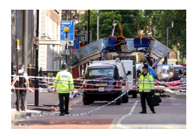
Police officers stand in front of a sealed off area around a bus in London after the July 7 terrorist attacks.

London suffered terrorist attacks on July 7 and July 21. The July 7 attacks were carried out by four suicide bombers who detonated their bombs on the London public transportation system, three in the Underground and one on a city bus. Fiftysix people, including the terrorists, were killed in the July 7 attacks and more than 700 were injured. Three of the bombers were UK-born citizens of Pakistani descent; the other was a British national of Jamaican descent and a convert to Islam. A video of one of the bombers, Mohammed Siddique Khan, was released through the media after the attacks, and in that video Khan attributed his act of violence to anger over UK foreign policy.